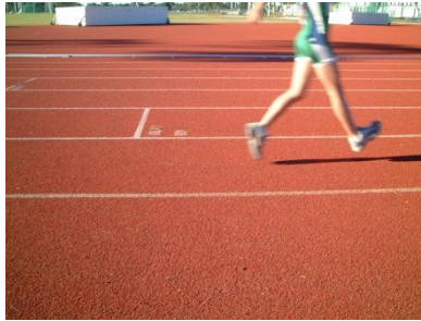
Loss of Contact