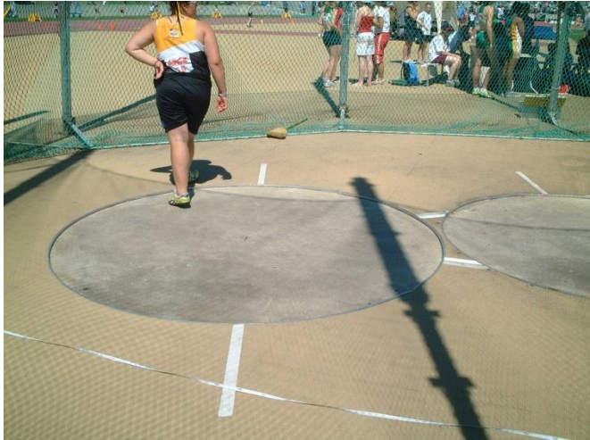
Leaving the discus circle